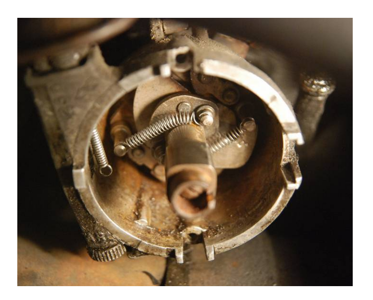
Fig. 1. Advance mechanism locked using springs

Because Amethyst calculates ignition advance electronically, the existing centrifugal advance mechanism needs to be disabled. This can be done with light extension springs or with lock wire.